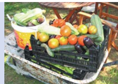
Organic veg from their own garden!

fruit). Unusually, good vegetarian options and even some sea food and fish dishes are included (the area is known for its fresh mussels!) – only the more expensive of these items carry a surcharge. Although typically 'no frills' taverna fare, we believe the holiday prices here to be good value. If you have any dietary requirements please advise us at the time of booking.