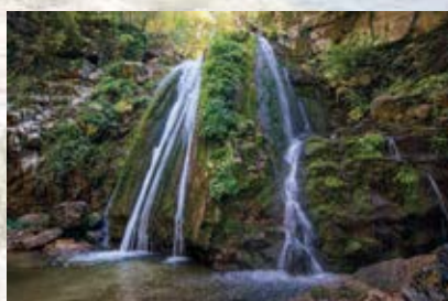
Waterfall near Olymbiada