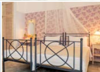
View from Akroyiali