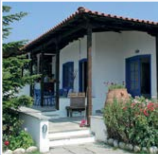
Skites Hotel Bed & Breakfast, Ouranoupolis

We have a selection of additional properties on Halkidiki available. Please see our website for details. Including: