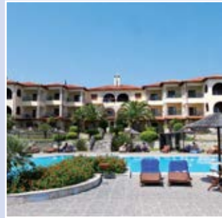
Blue Bay Hotel Bed & Breakfast, Afitos

For more information please see our website.