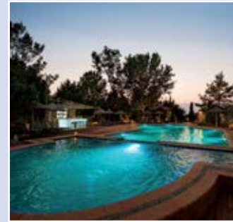
Petrino Suites Bed & Breakfast, Afitos

For more information please see our website.