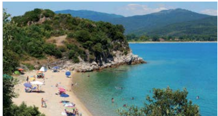
Stagira Beach, Olymbiada

For further information and an idea of local cost please see our website.