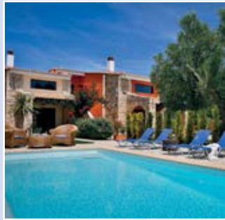
Nefeli Villas & Suites Self Catering, Nea Skioni (Kassandra)

For more information please see our website.